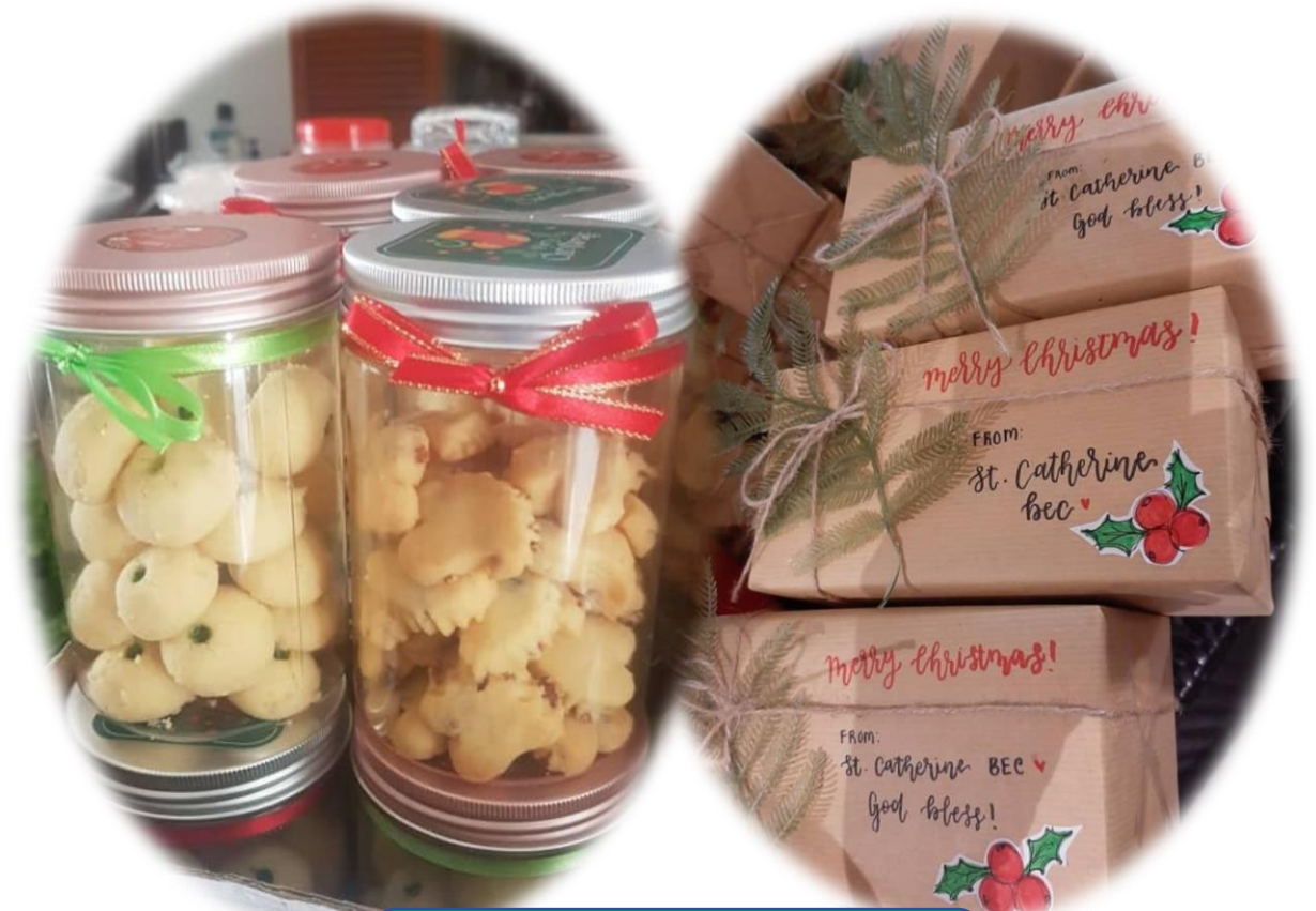
Advent 2020 Give-Aways