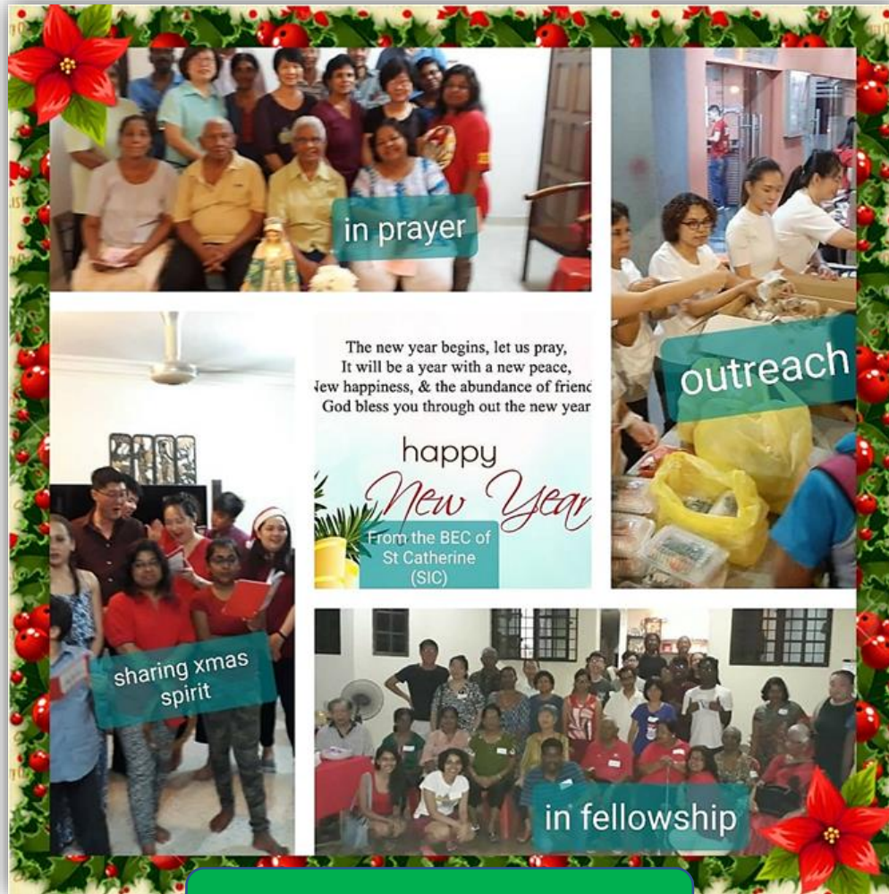
2019 ~ Mar 2020 Events